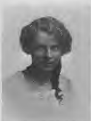
Above, Miss Dillon shortly before Mr. Herbert Armstrong met her. Right, Mr. Armstrong in front of Del Prado Hotel, Chicago at age 24.