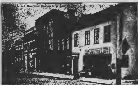
SCENE ON MAIN STREET, RICHMOND, KENTUCKY

on the platform, from S. R. & Co., order No. G262333.