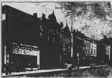
SCENE ON MAIN STREET, RICHMOND, KENTUCKY