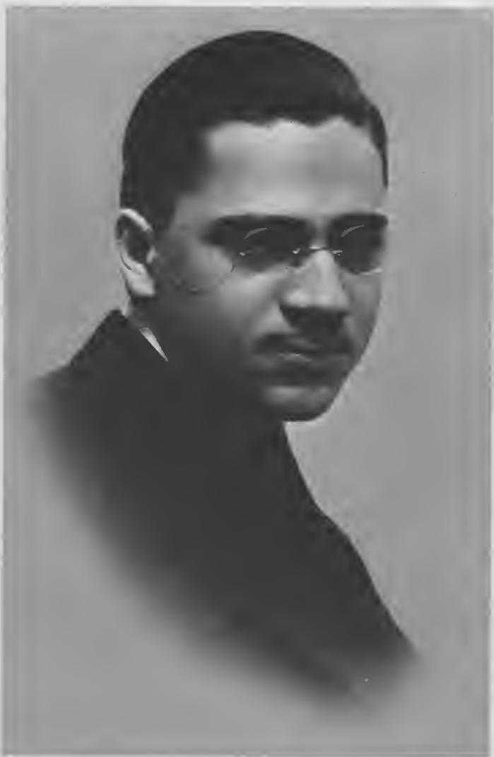
Mr. Herbert W. Armstrong at age 23.